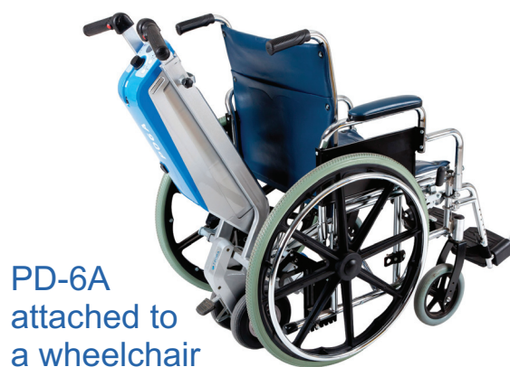
PD-6A attached to a wheelchair