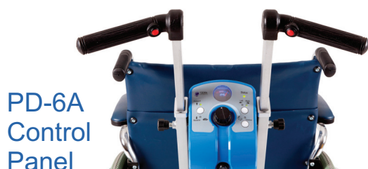
PD-6A Control Panel